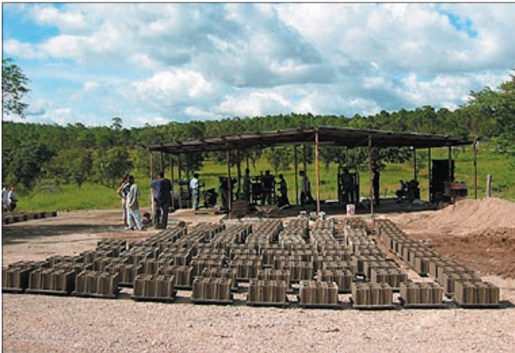
Our block factory. We produce about 400 blocks in five hours.