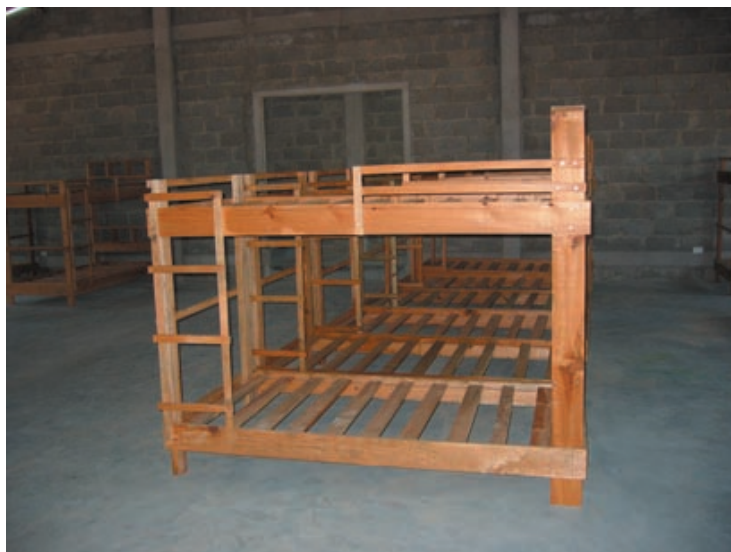
One of the twenty bunk-beds that a Teen Challenge group built for the new dorms this past month.